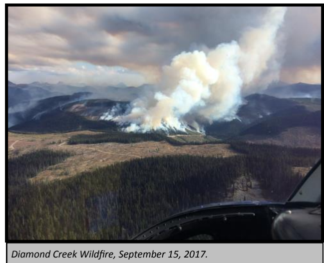
Diamond Creek Wildfire, September 15, 2017.

REMINDER: To protect public safety, an area restriction for Crown land in the vicinity of the Diamond Creek wildfire is still in effect. For details, visit: http://ow.ly/OZWw30eXoel . Cathedral Lakes Park and some recreation sites in the area remain closed.