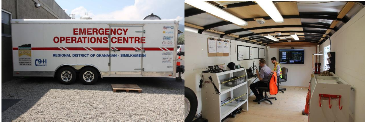
RDOS Mobile Emergency Operations Centre