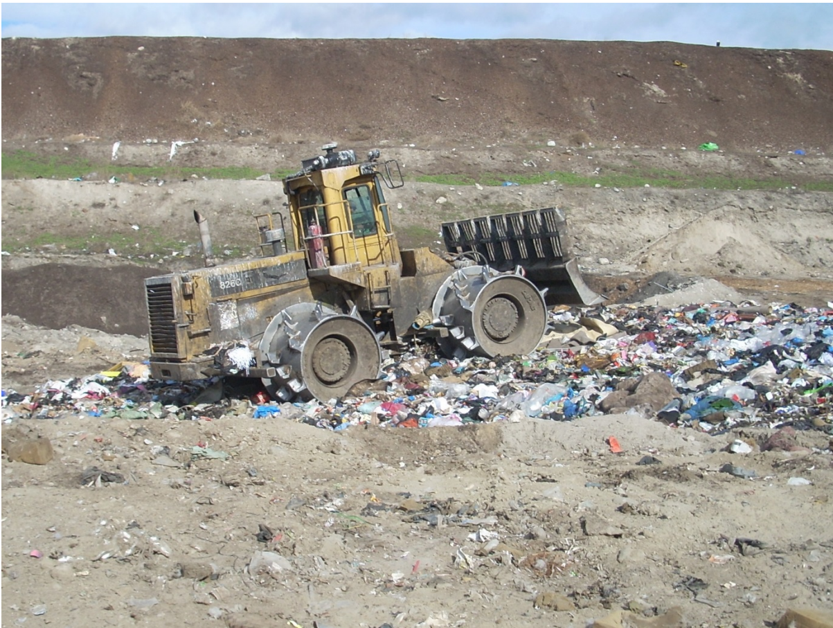
Compactor at Campbell Mountain Landfill, RDOS