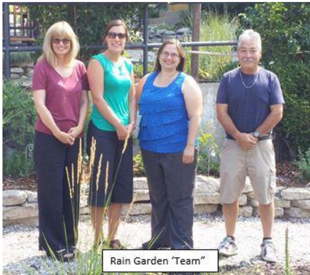
Rain Garden "Team"