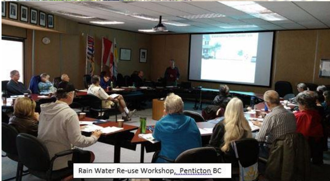
Rain Water Re-use Workshop, Penticton BC