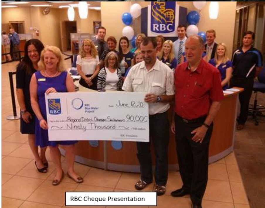
RBC Cheque Presentation