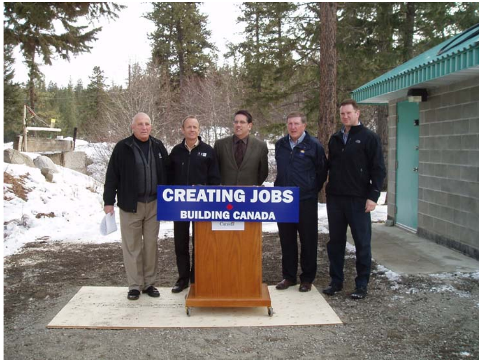
Grant Announcement for Faulder Water System