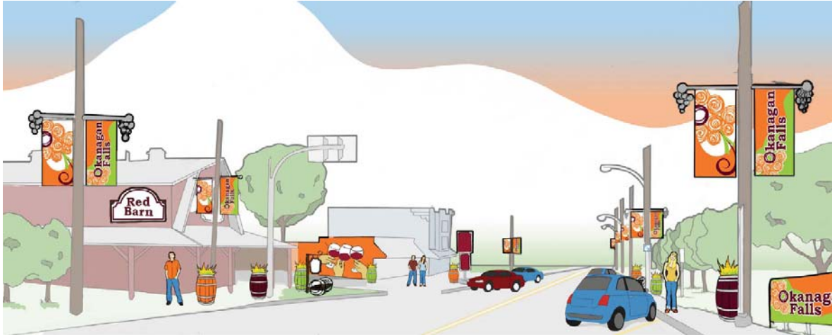
Okanagan Falls Beautification and Re-Branding Concept Image