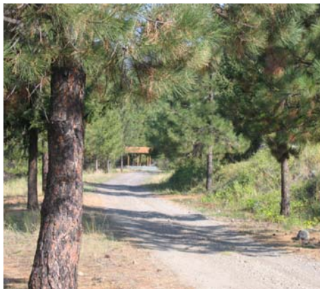
Osoyoos Lake Park