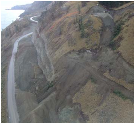
Manitou Park Naramata